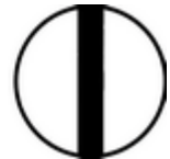
Slotted Hex Head