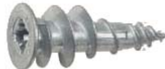
Zinc Twist Anchors