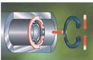
Internal Snap Ring