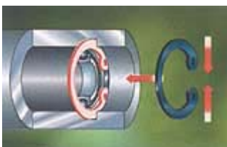
Internal Snap Ring