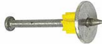
WITH 3/4” WASHER